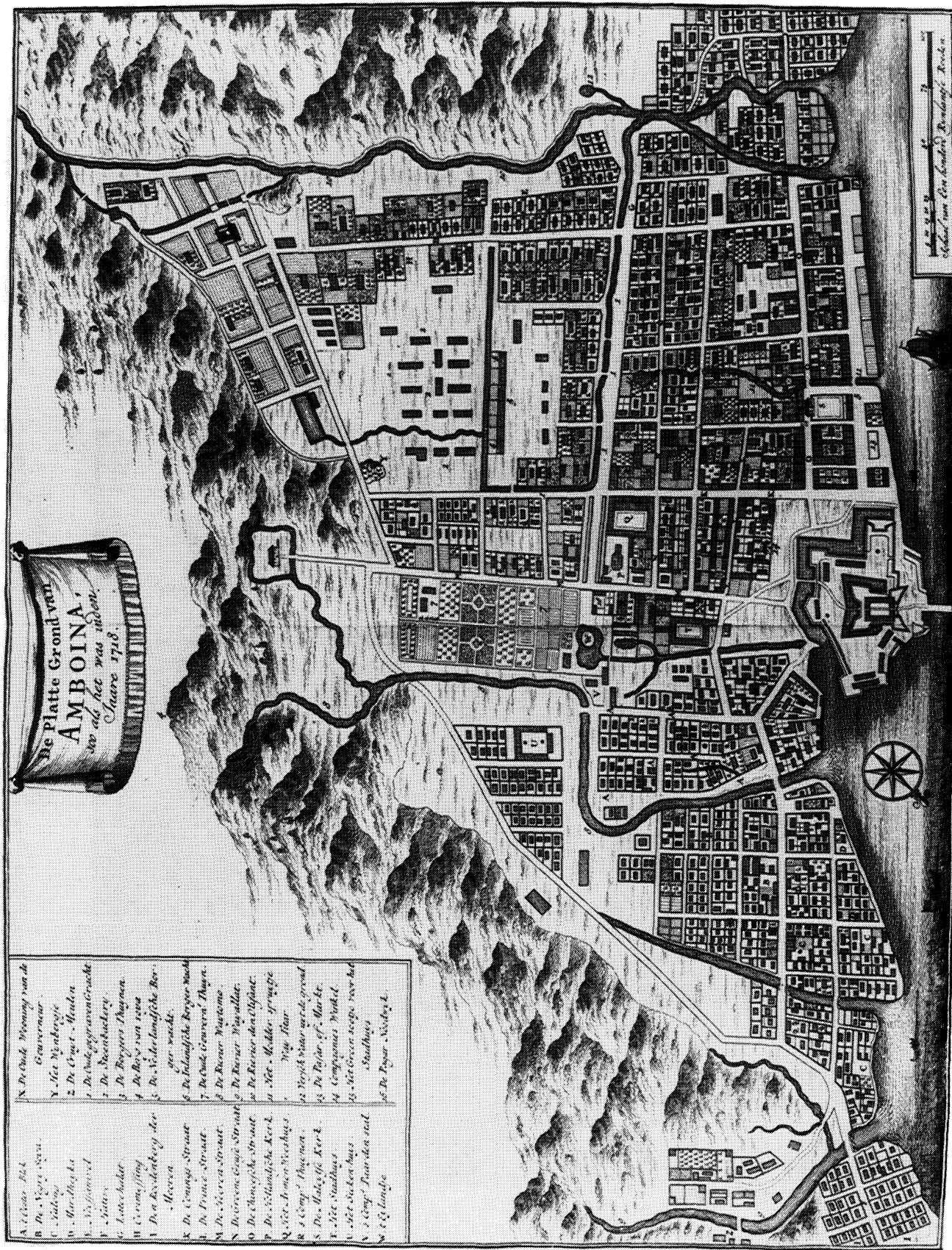
GROUNDPLAN OF KOTA AMBON in the beginning of the eighteenth century.