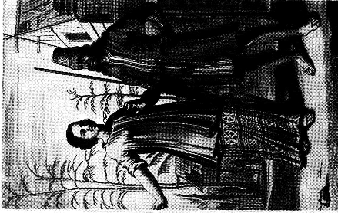
MAKASSARESE MAN AND WOMAN.

From J. Nieuhof, Gedenckwaerdige Zee en Lantreise . . . Oost-Indiën (Amsterdam: Van Meurs, 1682).