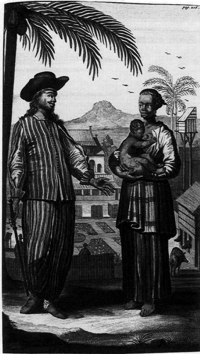
MARDIJKER MAN AND WOMAN.

From J. Nieuhof, Gedenckwaerdige Zee en Lantreise . . . Oost-Indiën (Amsterdam: Van Meurs, 1682).